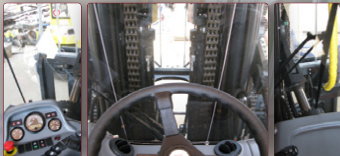
Enhance the restricted field of vision on forklift trucks.